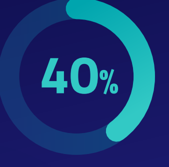
Over 40% of visitors leave a website if it takes more than three seconds to load

As a best practice, keep pop-ups and intrusive objects to a minimum.