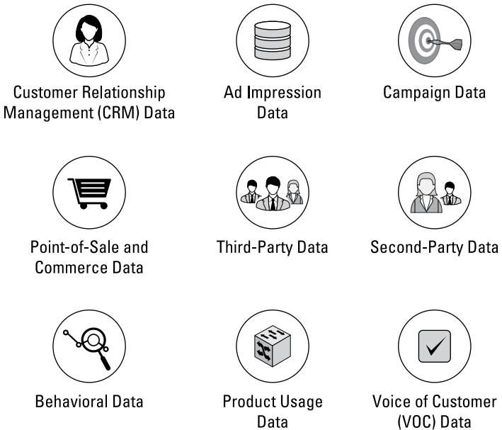
FIGURE 4-1: Tracking all your data sources.

Be sure that you have integrated all your data from disparate sources as shown in Figure 4-1, so that no insight is left behind.