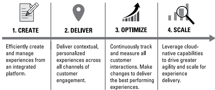
FIGURE 1-1: The Digital Foundation Model lets brands create, deliver, and optimize digital experiences at scale.